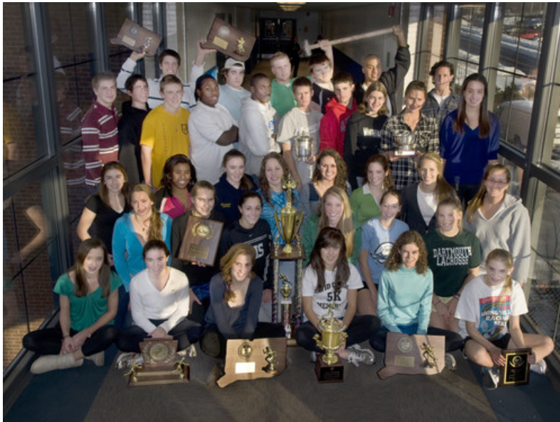
The Trophy Case at Glastonbury High School got much more crowded after a glorious fall season brought one significant achievement after another.

We also have named an area player of the year in each sport.