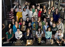
All-Courant Athletes Of The Year