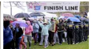
The 16th Annual American Cancer Society Making Strides Against Breast Cancer Walk