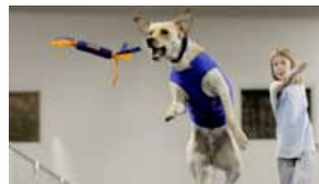
The 18th Annual CT Pet Show at the CT Expo Center