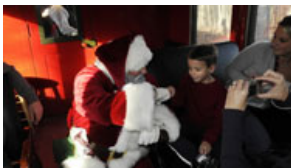
Santa Rides A Steam Train